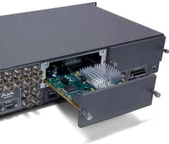
Corvid Ultra - rear panel

Shown with optional TruScale™ card installed