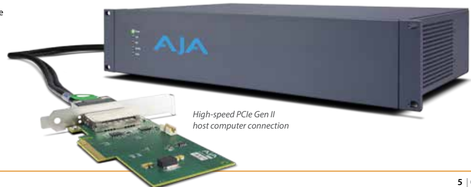
High-speed PCIe Gen II host computer connection

HDMI output HDMI 1.4 output capable of HD and 4K display.